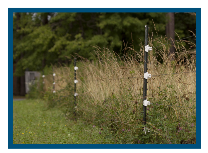
There are many fencing options to choose from.