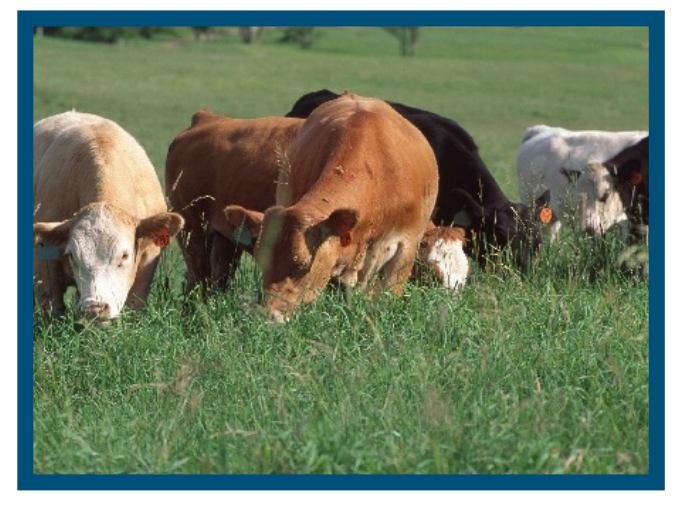
Let the livestock harvest their own feed for free!

In addition to energy savings, prescribed grazing has been shown to improve the profitability of cattle operations. In Missouri, beef cattle raised and finished on high quality pasture that is thick and lush have been shown to have a rapid average daily gain of two or more pounds and reach marketable weight within just 20 months at a cost of $27 per hundred-weight of gain, versus $60 in confinement. By applying grazing management, dairies in New York and Wisconsin found that pastured lactating dairy cows consistently provide a higher net farm income from operations over a 4 year period when compared to confined cows, whether measured per cow or per hundred weight of milk.