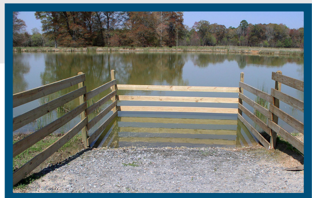
Using a farm pond as a water source