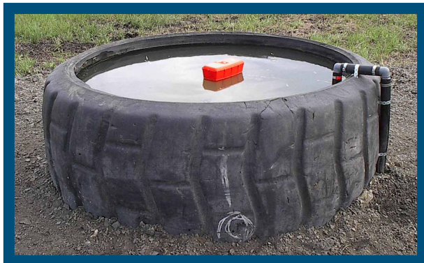
Heavy equipment tire waterer

Livestock watering facilities are permanent or temporary systems that ensure livestock have regular access their daily requirements of clean water.