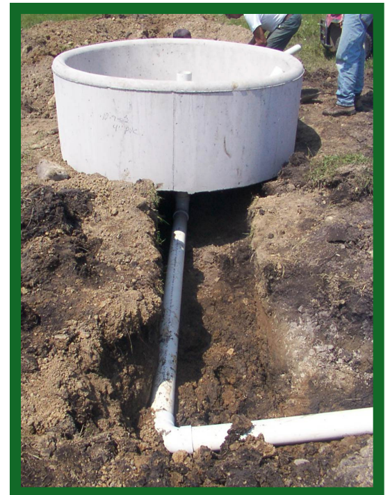
Bury permanent piping underground

Permanent or frequently used watering facilities should be protected from erosion and degradation. Refer to Conservation Practice PA561 - Heavy Use Area Protection, or talk to your local NRCS office, for more information.