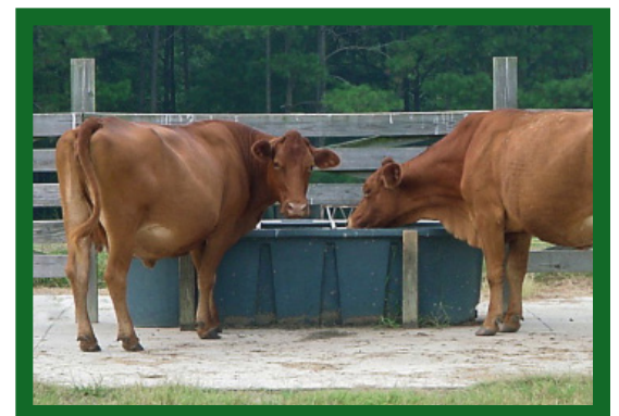
Protected permanent watering trough