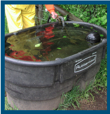
Heavy Duty Plastic