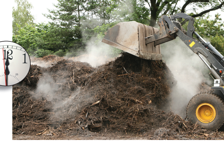
Compost piles may be turned occasionally to rejuvenate the compost process.

Having a strategy to handle mortalities before they happen can help an emotional situation be a little easier.