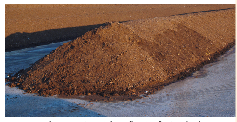
Windrow composting. Windrows allow air to flow into the pile. Windrows should be oriented so rain water can drain away freely.

More composting information can be found at http://cwmi.css.cornell.edu/mortality.htm or contact your local PennState Extension office.